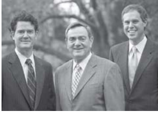
Derfner, Altman & Wilborn, L.L.C.

The firm's lawyers annually spend more than a quarter of their time on pro bono cases. They specialize in representing community groups in controversies that often end in litigation. Some of their recent projects have involved a successful suit to redraw county council election districts to end discrimination, a successful suit that saved an historic African-American cem-